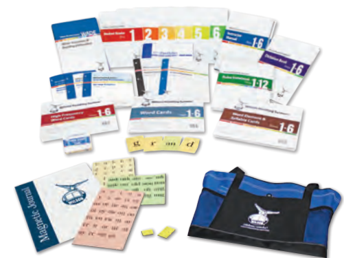
WRS Introductory Set (Steps 1-6), 4 th Edition

To order materials online, visit: store.wilsonlanguage.com